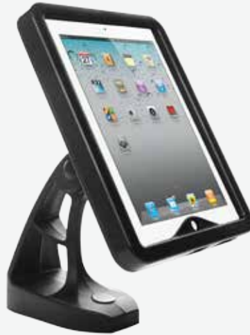
TABLE TOP MOUNT Product: 8.5" x 7.3" x 11.7" Base: 5.8" x 3.5" x 7.3" Weight: 2.3 lbs