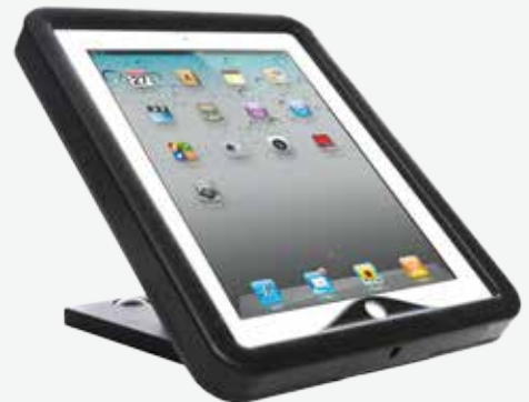
SECURE FLIP Product: 8.5" x 10.5" x 7.6" Base: 3.5" x 2.5" x 7.7" Weight: 2.8 lbs