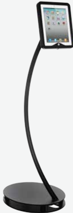
FLOOR KIOSK Product: 14" x 18" x 48.13" Weight: 31.5 lbs