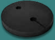
TABLE TOP MOUNTING BASE 6" x 6.5" x .075"