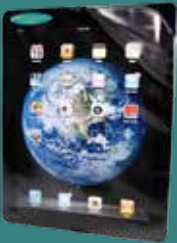
VIZIFLEX ANTI MICROBIAL SEEL