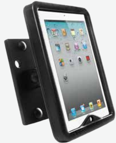
WALL MOUNT Product: 8.5" x 6" x 10.5" Base: 3.5" x 2.5" x 7.7" Weight: 2.8 lbs